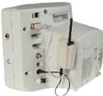
CAT 1588 Wireless device server mounted on 8100H Series monitor